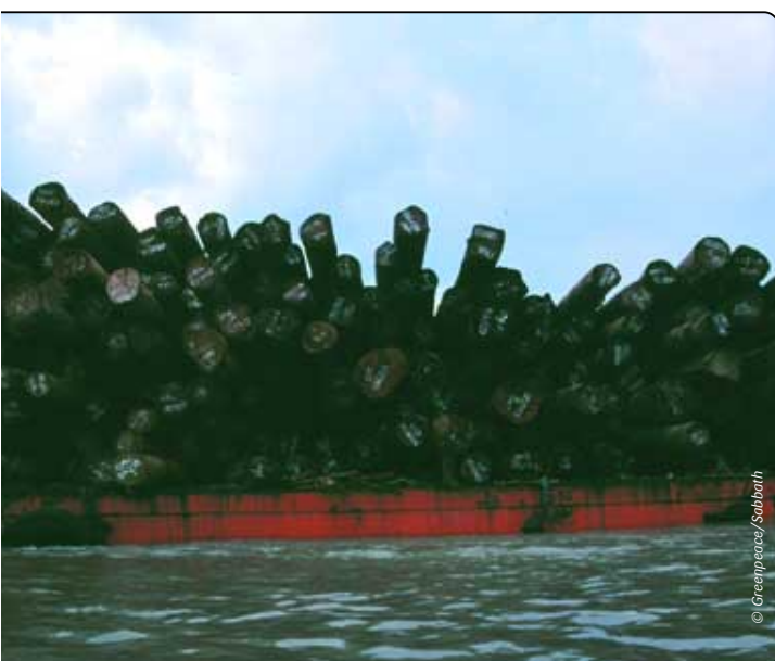
Barge loaded with Kiunga-Aiambak logs destined for export to China or Japan