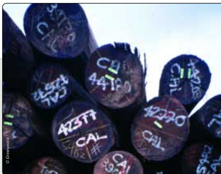
Logs of Calophyllum from Concord Pacific in China’s largest port, Zhang Jia Gang; Calophyllum is mainly used in the production of plywood and furniture, both of which are extensively exported to the US, Europe and Japan

At the same time, China has recently seen a rapid growth in its furniture sector, which is currently worth over US$12 billion a year. Dominated by foreign joint-venture companies, the export trade for this furniture is estimated to be worth more than a third of that total, with major markets in the US (55%), Hong Kong (15%), Japan (10%) and the EU (11.8%). 38 One of the main regions for furniture production within China is around Shanghai, where manufacturers are provided with easy access to the largest log port in China – Zhang Jia Gang. It is here that the majority of logs exported from Papua New Guinea to China are destined to go; it is also the main export destination for Concord Pacific’s Papua New Guinean logs. 39